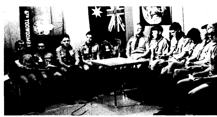
WAITING for the call, Australian Scouts sit up past 1:00 a.m. Sunday May 14 (Australian time). At Goddard, the conversation, which lasted more than an hour, began at 11 a.m. during Open House May 13.