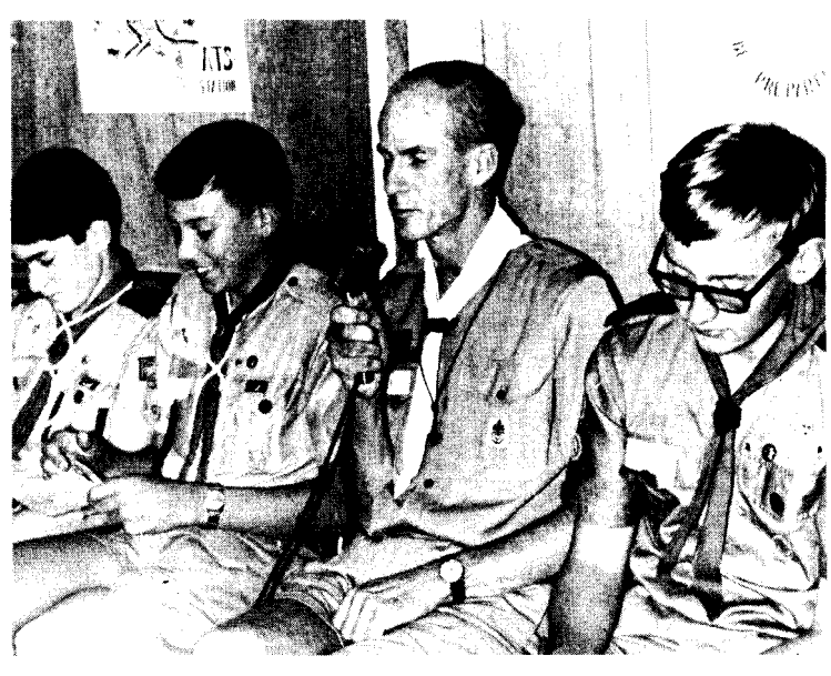
AUSTRALIAN BOY SCOUTS at the ATS ground station at Cooby Creek near Toowoomba, Australia, talk with Scouts at Goddard. The connection was made by the ATS-1 satellite and included two-way voice communication and one-way television contact from Cooby Creek to Maryland