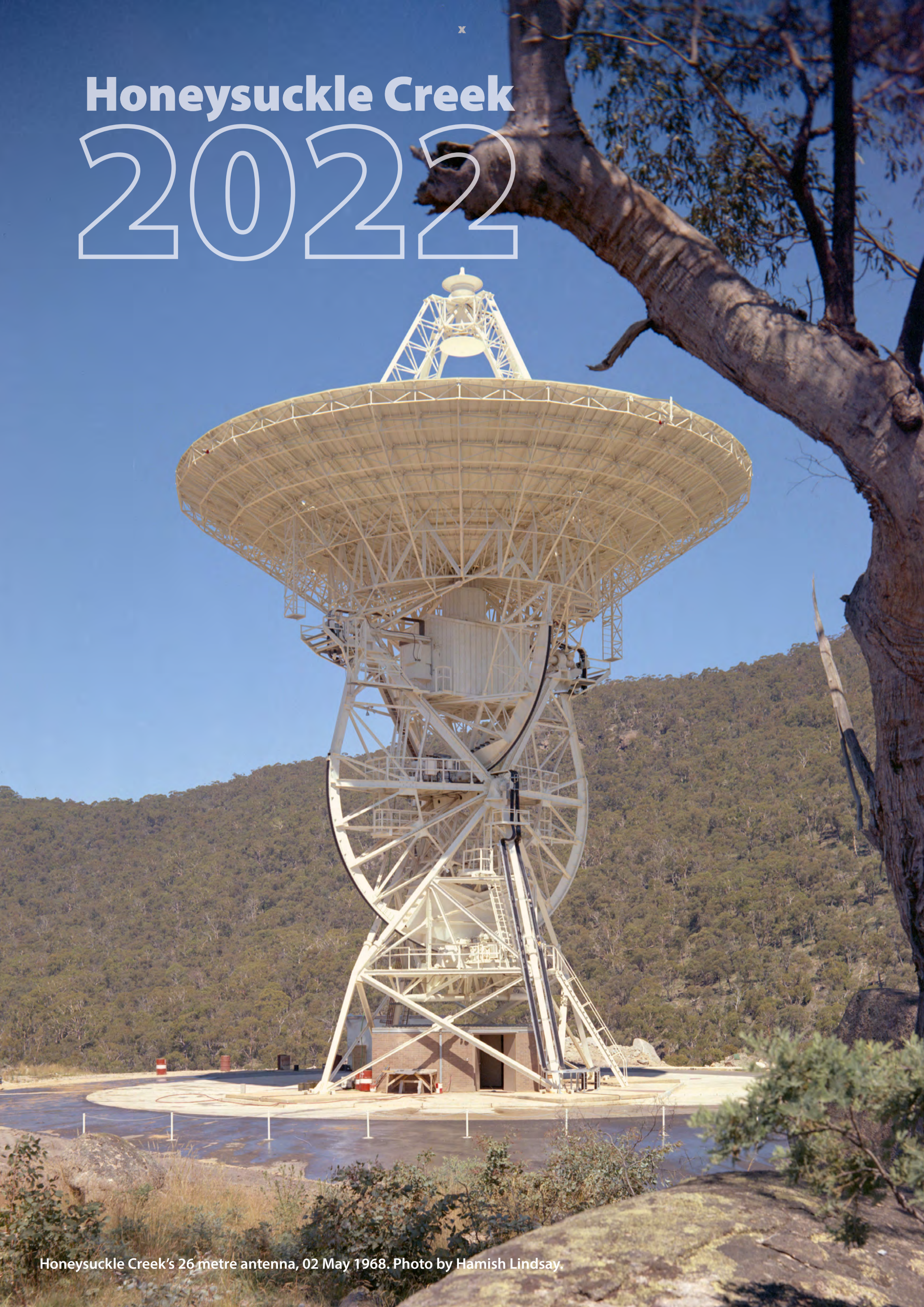
Honeysuckle Creek's 26 metre antenna, 02 May 1968.